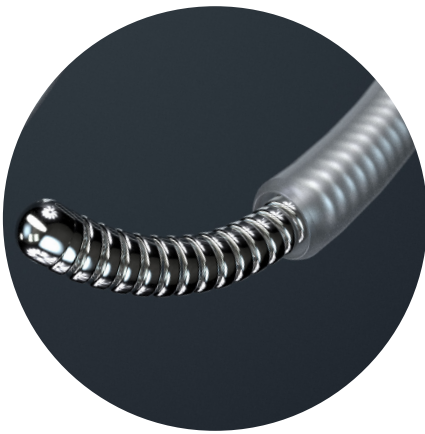
D*Clot® HD tip